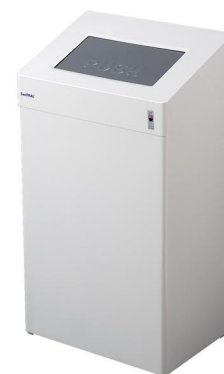
Art. no.: 1111 / 1112