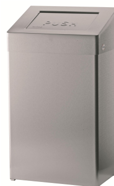
Art. no.: 1110 / 1113